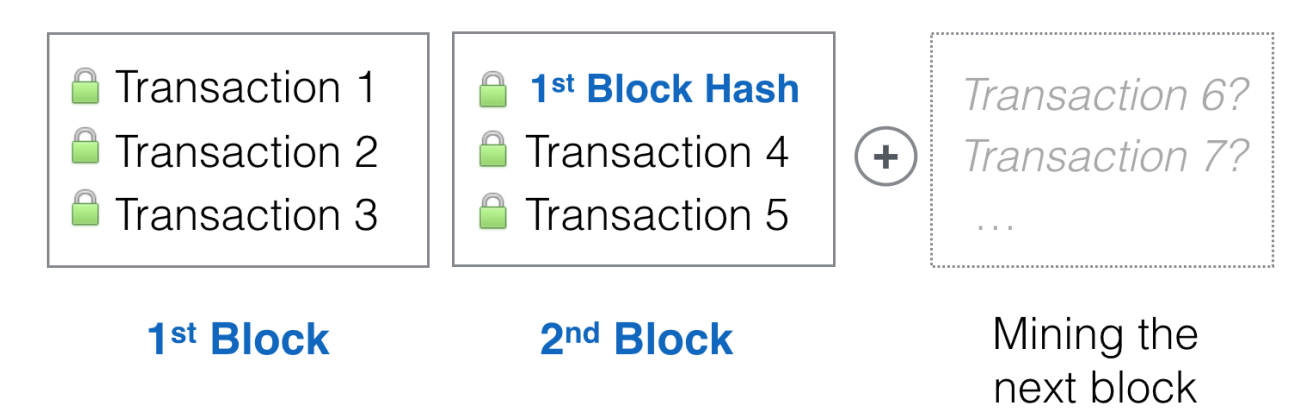
Figure A-2: A Blockchain

The distributed ledger where the shared data resides is called a 'blockchain' because it typically constitutes a chain of blocks of transaction data (see Figure A-2). Each one of the blocks contains valid transaction records for a specific period of time and their attributes. A key attribute of each transaction (and each block) is its timestamp. Blocks are chained together by incorporating a digital fingerprint of the previous block (a hash) in the current block. Any change in the transaction information contained in a specific block would alter such fingerprint, irreparably breaking the chain of consensus linking that block with all subsequent ones. As a result, one can think of a blockchain not only as a large-scale, distributed database, but also as an immutable audit trail where the 'DNA' of each block is incorporated in all following ones, making it impossible to alter history without being noticed.